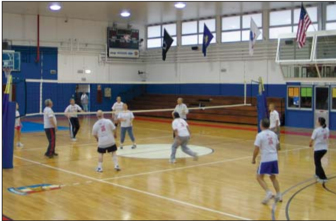
Students shut down staff in the local series of the Satellite Volleyball games.