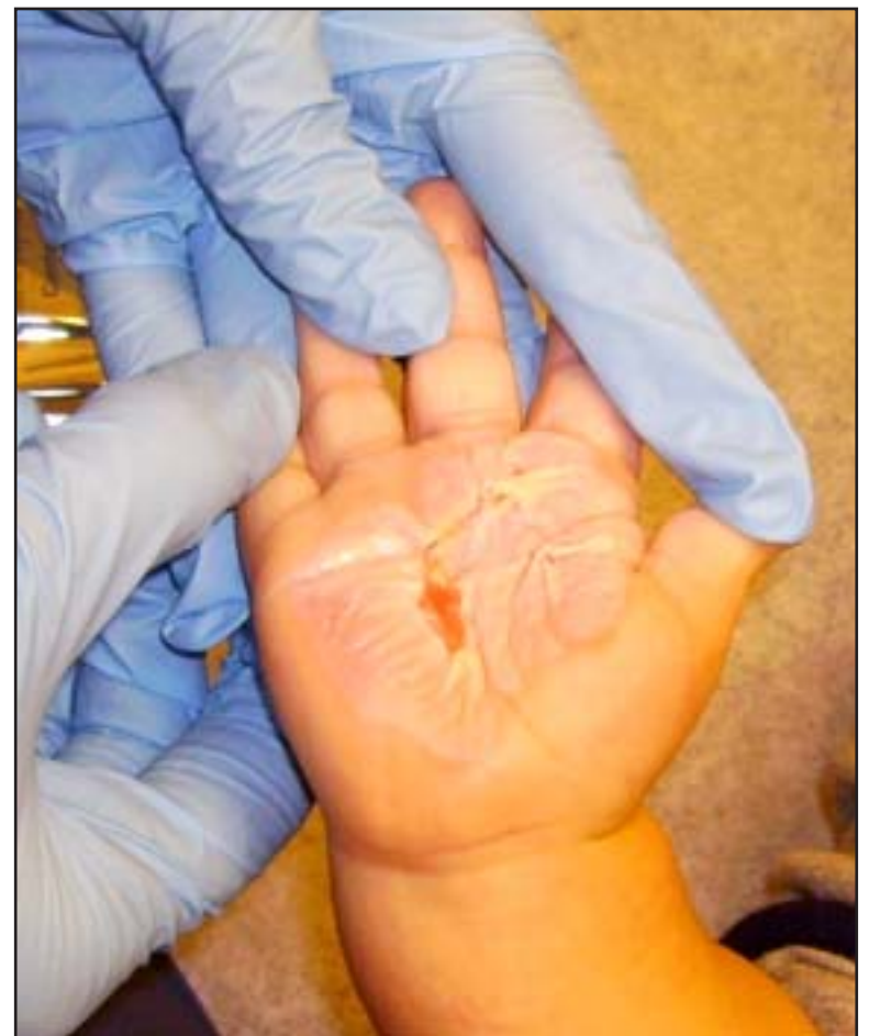
A child's hand burned on a hot oven door.

pan. Leave lid in place until pot or pan is cooled.