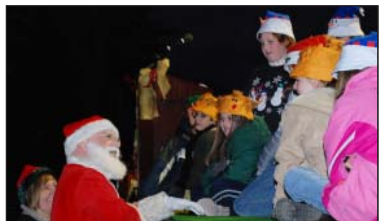
Santa speaks to members of the Vicenza Elementary School choir after their performance during the Holiday Tree Lighting Ceremony Dec. 5.

Santa’s appearance was followed by performances from the Vicenza Elementary School